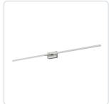
WS25350-BN-UNV Brushed Nickel