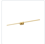
WS25350-BG-UNV Brushed Gold